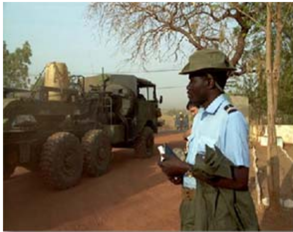
Senegalese gendarme timing the movement of his troops

In any event, chances are that in Africa, people will not show up precisely on time but this should not be a reason for you to be late as well. To their credit, many Africans change their time habits when dealing with Westerners to avoid frustrating them, and this, fortunately, has become a growing trend.