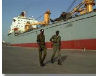
Gendarmes sénégalais en patrouille au port de Dakar