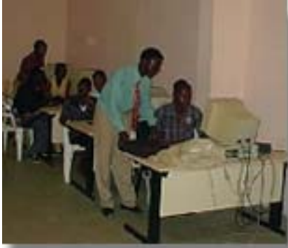
Un professeur dans un lycée sénégalais