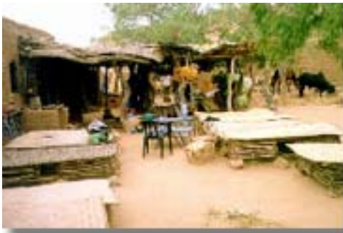
On travaille à la ferme...