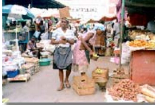
Une vendeuse dans un marché