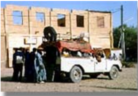
Un coxeur en train de parler aux passagers

fictive accounts because of the inevitable presence of heroes and learned men among the lineage members, helps often reassure one party of the clout and worthiness of the other. In political matters, the griots become the spokespersons of the nobility whose involvement with the general public is often limited. It is a profession handed down from generation to generation. Individuals born in the griot caste were expected traditionally to pursue the same career their parents and grandparents did and because of the rigidity of many social organizations in Africa, they were not allowed to move up the social ladder. Nowadays, however, the situation is rapidly changing. An increasing number of griot children are going to school, thus breaking away from a tradition that prevented their parents from exploring other professional horizons.