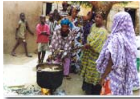
...et à la maison